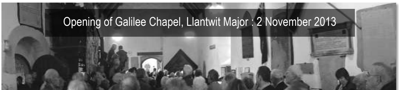
Opening of Galilee Chapel, Llantwit Major : 2 November 2013