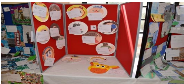
Our young artists show their animal spirits...