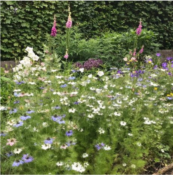
Country cottage charm at Carreg Llwyd