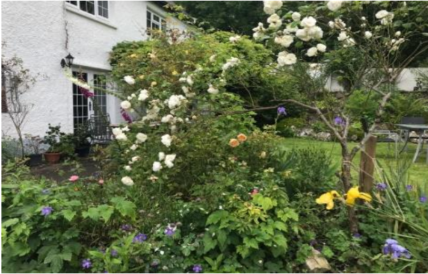
Everything coming up roses at the Old Parsonage

Autumn is a great time to prepare and plant for next year. Happy Gardening!