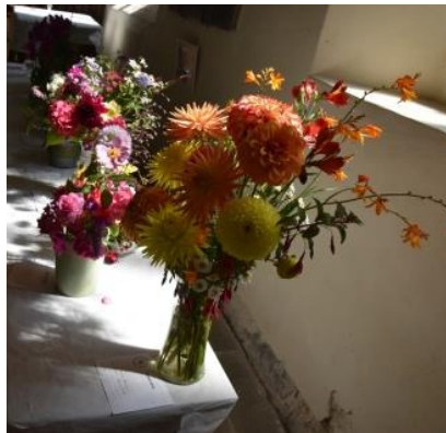
Garden bouquets triumphed against the week's battering rainstorms