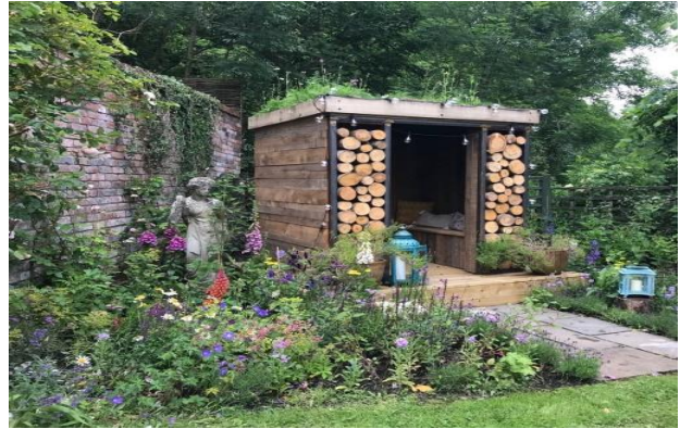
Desirable home from home at Woodlands