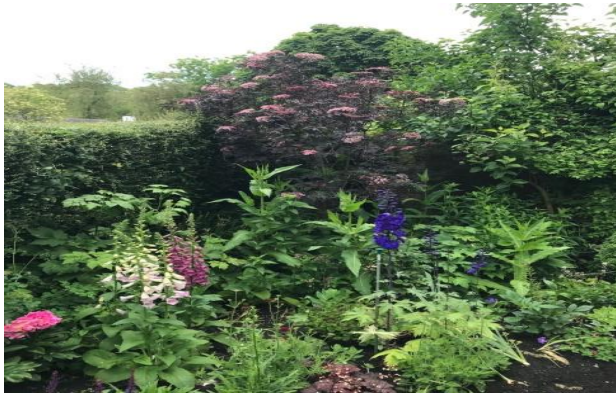
Picture-perfect planting at Fern Cottage