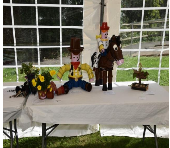
Cowboys won out in the Flowerpot People showdown