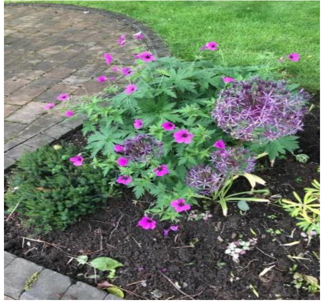
In the pink at Windrush

“Rain, rain, go away!” was our mantra in the week leading up to the first Llancarfan Society village Open Garden day on June 15th..... and we were fortunate. Having endured what seemed like a battery of never-ending heavy showers whilst preparing the gardens, a day of mainly sunshine (with a couple of showers) encouraged more than 60 visitors to take in the air and appreciate what our gardens and characterful village had to offer.