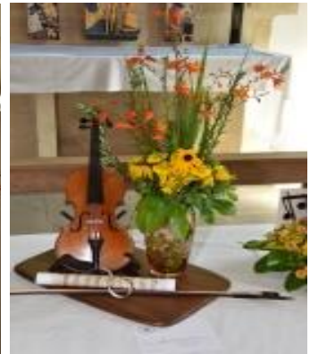
...and other flowers were set to music