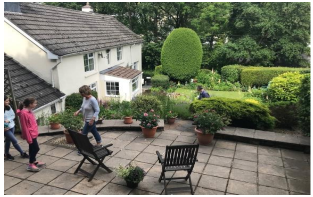
Warm welcome at Brook Cottage