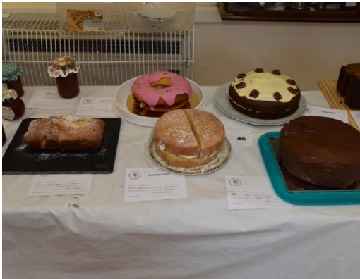
Competitors entered the Clash of the Cakes hoping to taste sweet victory