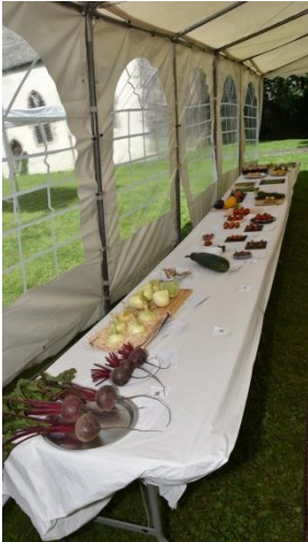
Gardeners brought their best, from gargantuan onions to embarrassing vegetables

Sandwiched between apocalyptic storms , the morning of the Village Show braced itself for an afternoon of watersports. But no! On August 17th the sun shone bright and stayed all day to join the fun. After months of hard work, the committee (and attendees) were rewarded with a real village celebration, showcasing craft and horticultural skills. A full list of trophy winners is below – these were just some of the highlights: